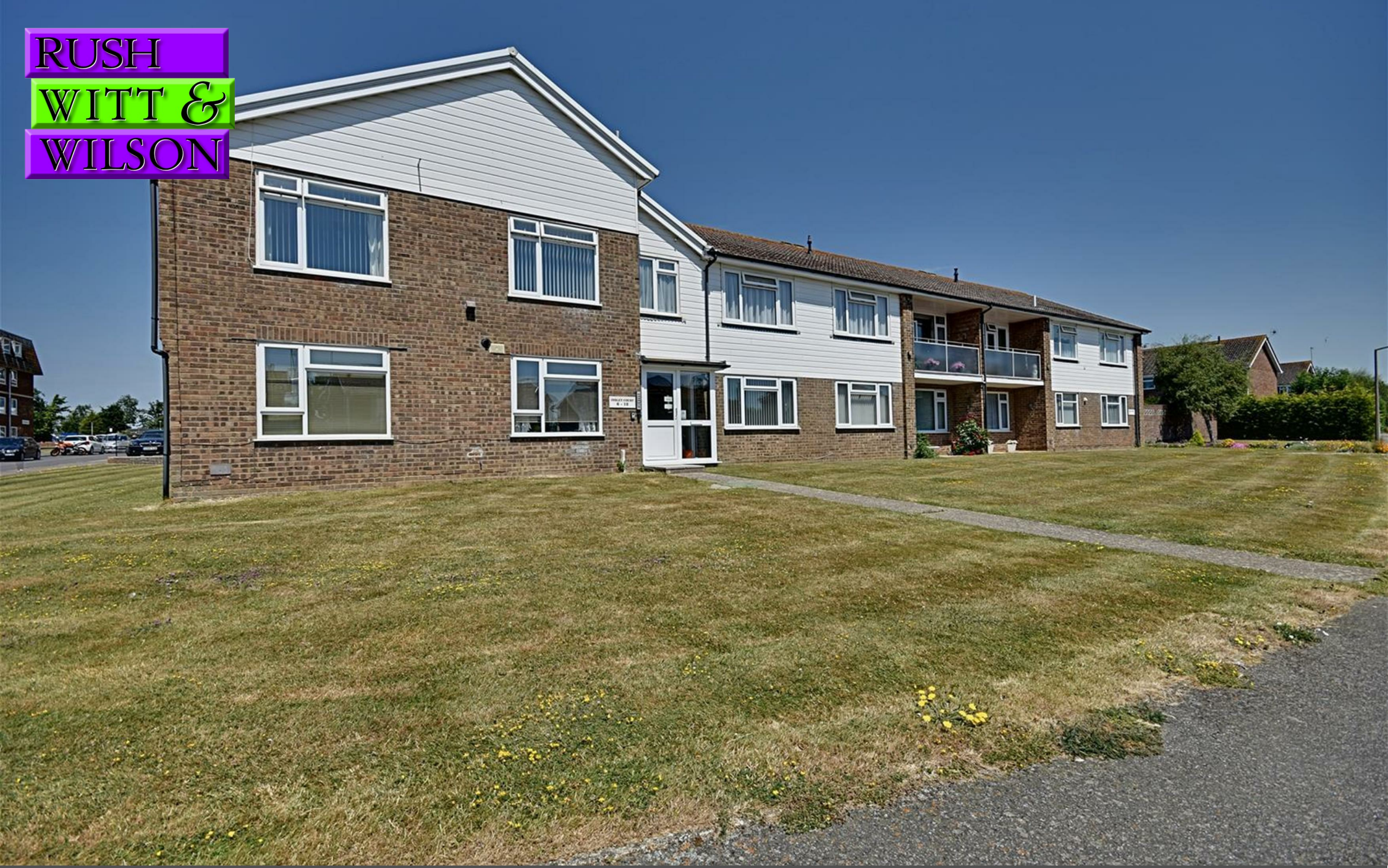
10 Insley Court Normandale, Bexhill-On-Sea, Sussex TN39 3NS £289,000